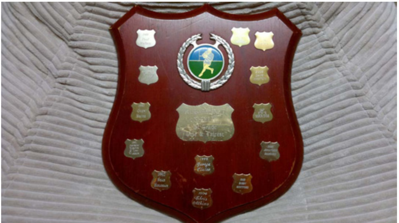
The Aub Bennett Shield – 1 st Grade Best and Fairest