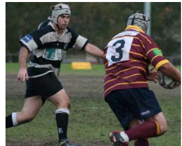
Don't worry, I've got him