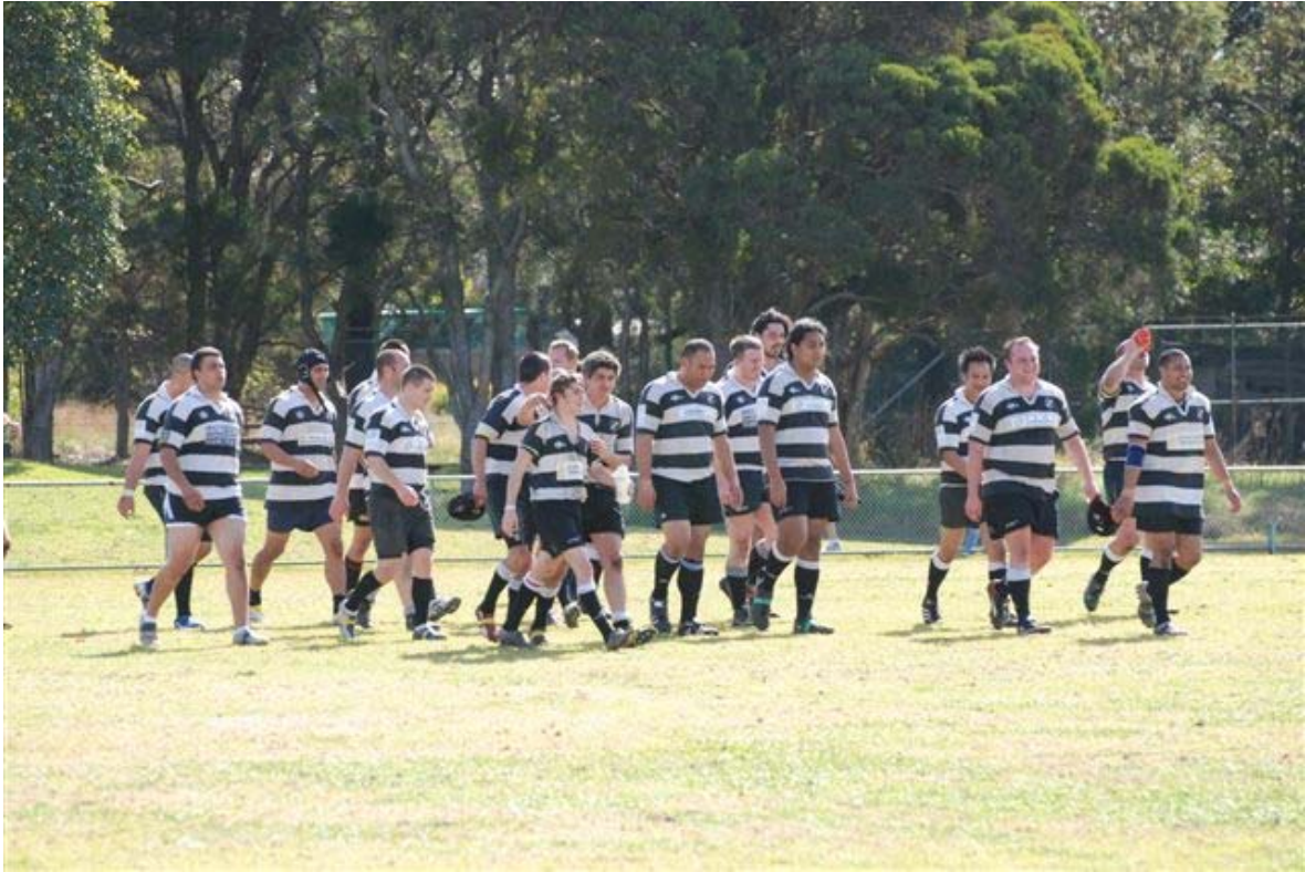
3 rd Grade "Winners are grinners" after their semi final thumping of Balmain 35 – 7.