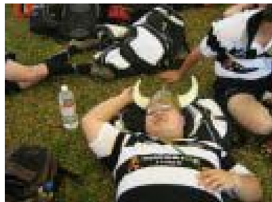
Panda Warms up