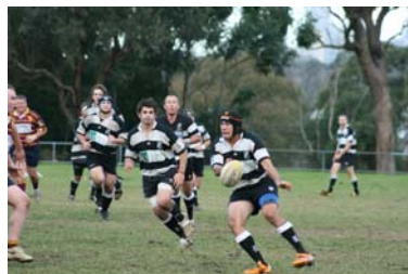
My boots will distract him